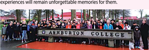
(Pictured above): With their host families, just before leaving Ashburton to return to Japan.

All the students said 'my host family is so kind and lovely. Food is nice! Had a great weekend and had an amazing experience'. They also found a huge difference between Japanese and New Zealand schools. All their experiences will remain unforgettable memories for them.