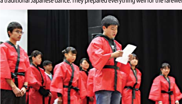
(Pictured above): Part of their presentations during the evening.

A farewell evening was held on the Thursday evening and, after dinner, Japanese students received a certificate and a small New Zealand present, and had a splendid presentation time, putting on a show for their host families. They sang a few songs, including their school song, and performed a traditional Japanese dance. They prepared everything well for the farewell.